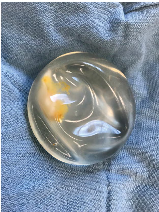
Fig. 2. Silicone breast implant with a single puncture site (lower left) and obvious yellow fat within the implant.

Due to the concerns for implant rupture, the patient was taken to the operating room in June 2019 for implant exchange. Her original mastectomy scar was used to access the pocket. The implant was identified and removed, at which point we noted a single small puncture site and obvious yellow fat within the implant shell (Fig. 2). There was no free silicone or fat within the pocket. We proceeded with placing a new implant and further fat grafting (200 mL to the right side only).