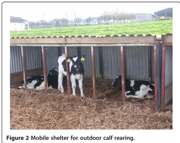
Figure 2 Mobile shelter for outdoor calf rearing.

Differences in calf LW were observed at day 38 ( P < 0.01 ), 52 ( P < 0.001 ), 66 ( P < 0.001 ) and 80 ( P < 0.001 ) with ODO having lower LW than either OD or TD (Table 1). The total weight gain from day 10 to 80 was 47, 49 and 45 for OD, TD and ODO, respectively. Calf LW at day 80 was 86, 89 and 85 kg for OD, TD and ODO, respectively. The ODO calves had lower ( P < 0.05 ) average daily gain (ADG) for period (day 25 to 38) and for period (day 39 to 52) ( P < 0.01 ) compared to either OD or TD (Table 2). TD had higher ADG for the week