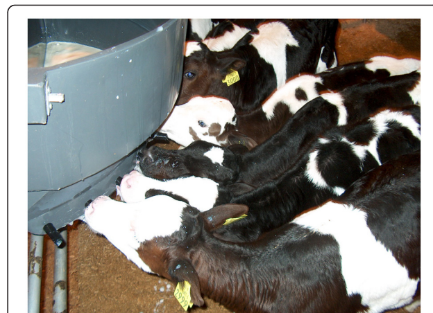
Figure 1 Calf milk feeding using a mobile teat feeder.

Experiments 1 and 2 were conducted in years 2007 and 2008, respectively, with a number of common calf rearing procedures used for both experiments. Calves on each treatment were penned in groups of nine and each treatment group was replicated. Group pens were filled before calves were assigned to the next treatment group. This method was used to assure equal age profile within pens and to maintain a stable number of calves within each pen. This method also facilitated weaning steps. All calves were fed twice daily with colostrum for 3 days and then whole milk until day 10. Calf feeding times were 0900 h for OD calves and calves fed TD were offered their second feed at 1530 h. Whole milk was collected daily, during milking for calf feeding, after plate cooling (milk temperature ranged from 10°C to 15°C). All calves were fed using mobile teat feeders (not individually sub-divided) suspended on the gate of each pen or paddock (Figure 1). After each feeding occasion milk teat feeders were removed and washed with running water. Calves, offered WM twice daily, received 2.25 liters of milk at each feeding time. Calves offered WM once daily received 4.5 liters of milk at the morning feeding time. Electrolytes were added to water and offered to calves where calf diarrhoea was diagnosed. Calves