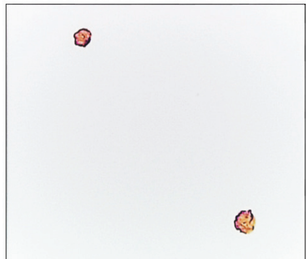
Figure 2. Histopathological analysis of the cerebrospinal fluid. Immunohistochemistry stains with CD20 confirmed the presence of CD20-positive lymphomatous large cells (magnification, x40).

Four days after HD MTX infusion, she developed sudden jerking movements of the upper limbs with drooling of saliva and extensor posturing of the body. She suffered another complex partial seizure with secondary generalization a few hours later, which aborted spontaneously. She did not have any fever, hypoglycaemia or signs of meningism. Neurological examination was otherwise normal. An urgent CT scan of the brain did not identify any new intracranial lesions nor was there any epileptiform activity on an electroencephalogram (EEG) performed the following day. She was subsequently treated with levetiracetam and there had been no recurrence of seizure since.