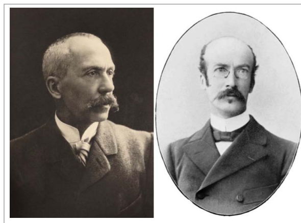
Figure 1. Charles Richet (1850–1935) (left) and Jules Héricourt (1850–1938) (right).