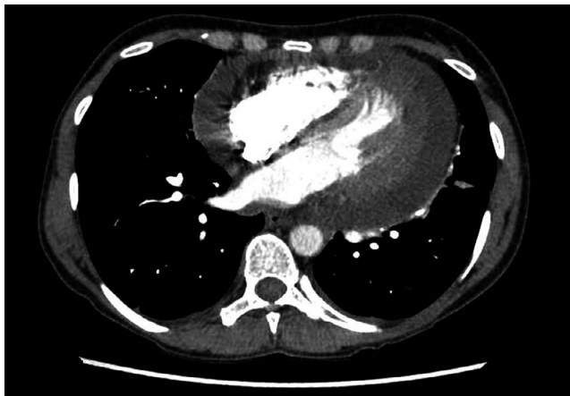
FIGURE 2 CT chest revealed a large pericardial effusion

She underwent pericardiocentesis yielding 700 mL of bloody effusion. Biopsy of the pericardium showed nonspecific inflammation.