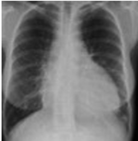
FIGURE 1 CXR revealed a large cardiac silhouette