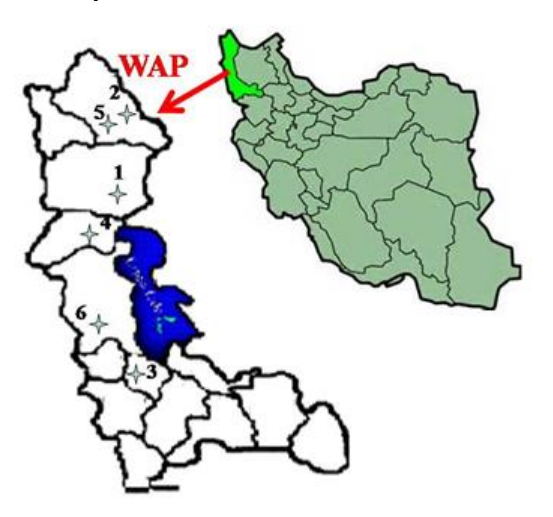
Fig.1: Map of West Azerbaijan Province, northwestern Iran (WAP) and the study sites. 1: Shabanlu; 2: Marganlar; 3: Shorgol; 4: Qarabaagh; 5: Ghargologh; 6: Gharahaghaj

Field-collection of the lymnaeid snails was undertaken in six freshwater bodies located in both mountainous (altitudes over 1000m above sea level) and plain areas of northern, central and southern parts of West Azarbaijan over a period of eight months from May to December 2010 (Fig.1). The collected snails of each site were placed individually into the plastic screw-capped containers and transferred alive to the Laboratory of Malacology of Faculty of Veterinary Medicine, Urmia University. Of 6,759 collected lymnaeid snails, the snails of L. gedrosiana were identified using the identification keys provided by Mansoorian (21) and Pfleger (36). The identities were then verified by the Parasitology Museum of the Faculty of Veterinary Medicine of Tehran University.