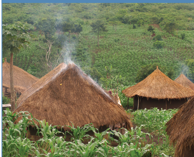
Figure 1. Biomass fuel smoke escaping through thatched roofs