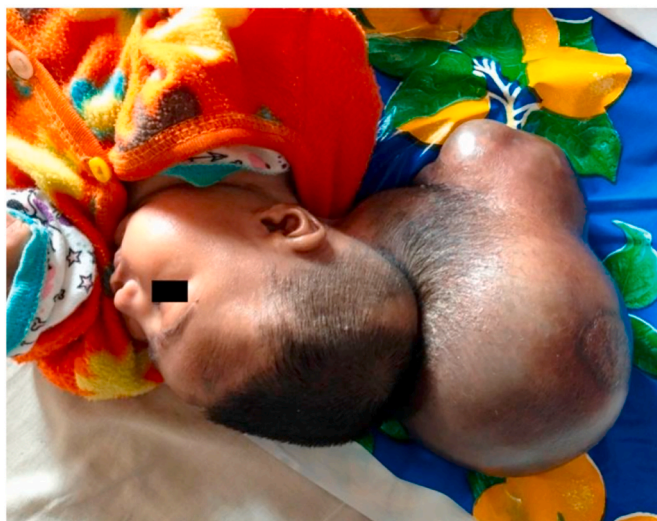
Fig. 1. A giant occipital encephalocele measuring 20 \times 15 \times 17 cm.

The understanding of the etiopathogenesis of NTD and its association with folic acid deficiency has made its supplementation a vital step in the control of this condition. Supplementation of folic acid, routine prenatal care and legalization of abortion in developed countries has led to a diminish in encephalocele and other neural tube defects. In developing countries, fortification of food items with folic acid is not done routinely. This is why, a higher incidence of encephalocele and giant encephalocele exists in developing countries [10]. However, according to her antenatal history, folic acid supplementation to her mother was