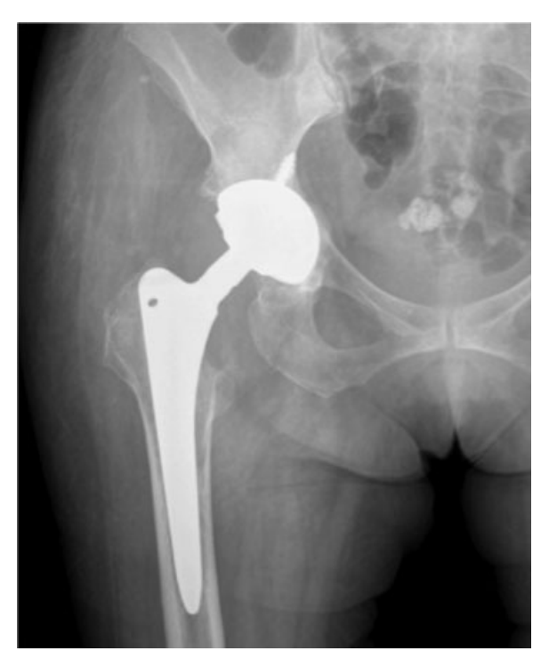
Fig. 2 Postoperative X-ray: a revision with a tantalum cup, reinforced with three screws, with ceramic on ceramic coupling + homologous bone filling of acetabular and trochanteric defects.

The toxicological screening was repeated 1 month after surgery and showed the following results: blood cobalt = 0.15 \mu g/L; blood chromium = 0.42 \mu g/L; urine chromium = 0.69 \mu g/L; urine cobalt = 1.95 \mu g/L.