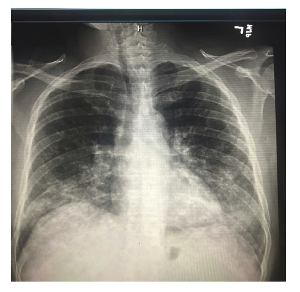
Fig. 1. Chest X-ray AP view showing interval worsening of the bilateral upper and lower lobe patchy airspace opacities with nodular appearance.