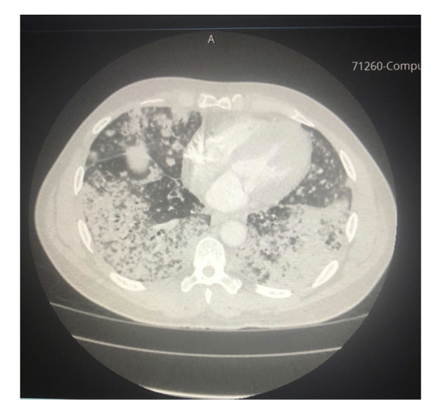
Fig. 2. CT scan of the chest showing extensive bilateral parenchymal infiltrates with mediastinum lymphadenopathy.

and non-small cell lung carcinomas (NSCLC), with both types combined comprising around 95% of all lung cancers. This classification is useful for guiding staging, treatment and in predicting prognosis. NSCLC comprises around 85% of all lung malignancies and is divided into several histological subtypes, including adenocarcinoma, squamous cell carcinoma and large cell undifferentiated carcinoma among others. Adenocarcinoma represents the most common histological type of lung cancer especially in non-smokers [2].