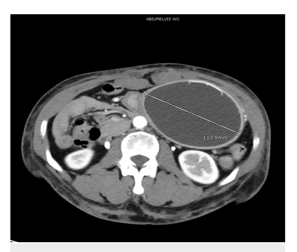
FIGURE 4: Computer tomography of abdomen showing balloon placed in the stomach and its diameter