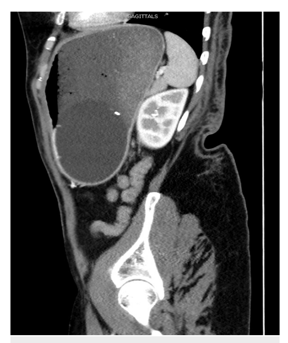
FIGURE 3: Sagittal view of the Elipse™ intragastric balloon obstructing the gastric outlet