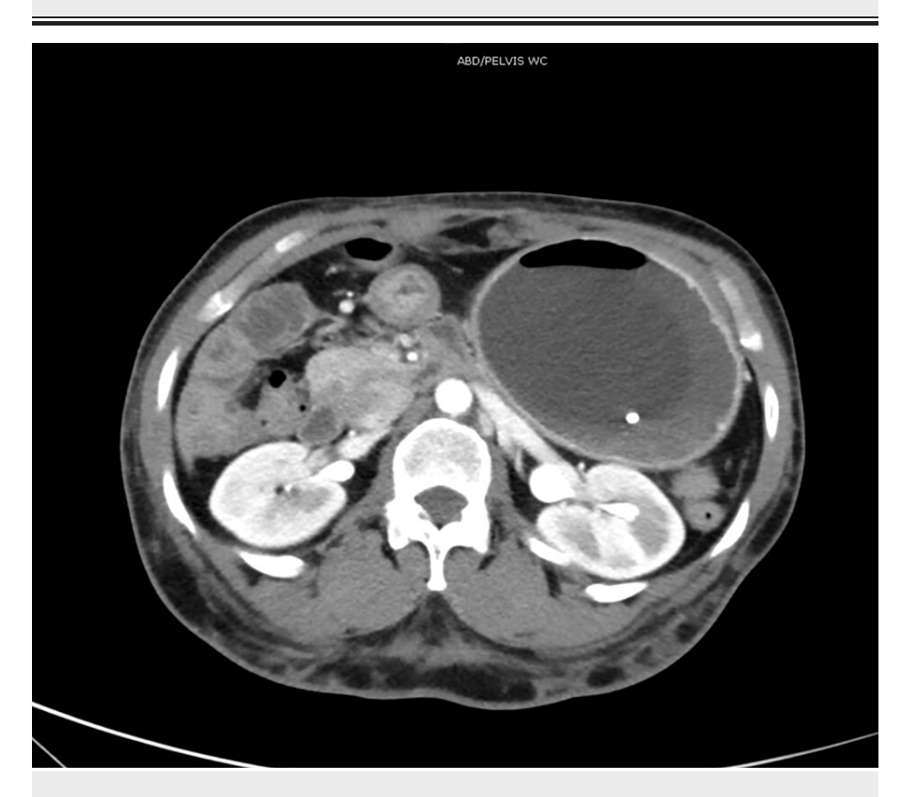
FIGURE 2: Computer tomography of abdomen showing the balloon marker