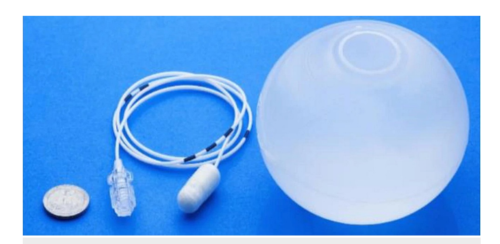
FIGURE 1: Allurion Elipse™ balloon with catheter for inflation