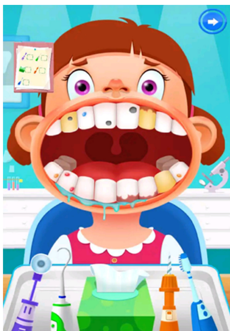
Fig. 1. Little Lovely Dentist app

The confidence was 0.95, the probability was 0.05, and a sample size of 46 was obtained. However, considering the risk of subjects dropping out, we selected a sample size of 50 children and recruited them randomly into the trial based on the following inclusion criteria: