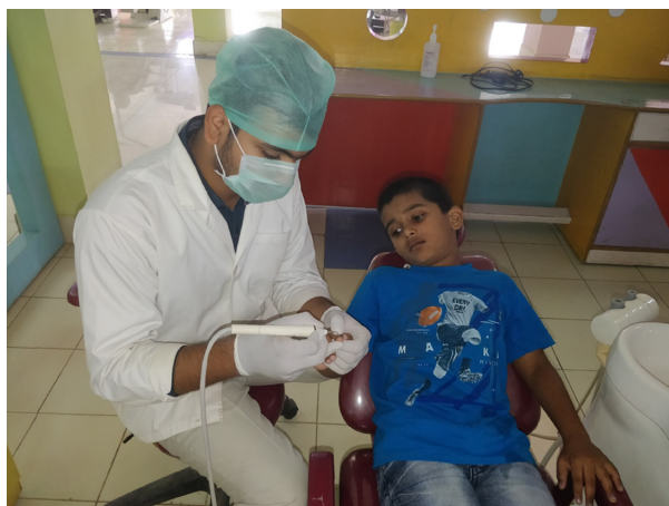
Fig. 3. Conditioning the child using tell-show-do