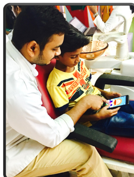
Fig. 2. Educating a child about the procedure using the dental app