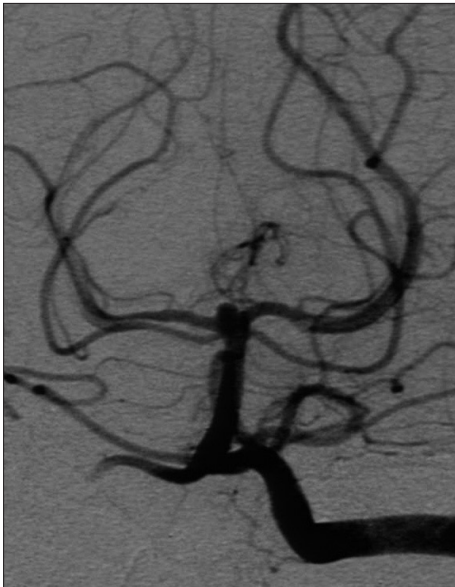
Fig. 1. Working view of the left vertebral artery angiogram showing the aneurysm at the basilar tip prior to endovascular intervention.

Class 1 : complete occlusion, Class 2 : remnant neck (nearly complete occlusion). H-H grade : Hunt and Hess grade, mRS : modified Rankin Scale, Cx : complication, MCA : middle cerebral artery