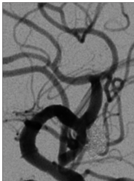
Fig. 6. Follow-up angiography was performed 13 months after treatment. Working unsubtracted view of right ICA angiography shows a no interval change after initial treatment.

The endovascular treatment of intracranial aneurysms with detachable coils has developed into a widely used and effective technique. Despite increasing clinical experience and technological improvements, endovascular treatment still has inherent risks of morbidity and mortality. In particular, this treatment is