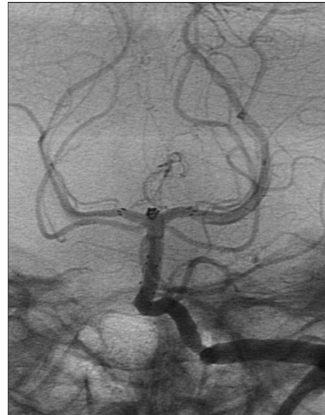
Fig. 2. Immediately post-treatment, working unsubtracted view of the left vertebral artery angiogram showing optimal deployment and no contrast dye filling in aneurysm sac after Y-stenting coiling.

aneurysm base. 2.5×20 mm and 2.5×20 mm Neuroform stent placed was 20 mm in length and was deployed from the left PCA into the basilar artery. The microwire was pulled retrograde into basilar artery, then advanced through the stent struts. The second, 20 mm stent, was advanced over the wire through the first stent within the basilar artery then through the struts of the left PCA stent and into the right PCA.