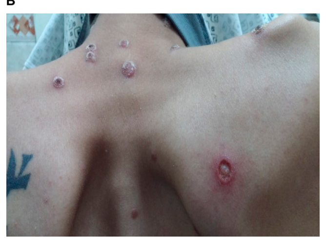
FIGURE 1. (A) Ulcerative crusted lesions can be seen on the face, with involvement of forehead, nose, cheeks and chin associated to purulent draining secretion. (B) Papules with ulceronecrotic center on the chest.

Herein, we describe a 25-year-old man who presented a rare widespread form of secondary syphilis characterized by fever and disseminated ulcerative crusted lesions of 1 month duration and in whom malignant syphilis was diagnosed. This is one of the few reported cases of malignant syphilis in adults with human immunodeficient virus (HIV) infection.