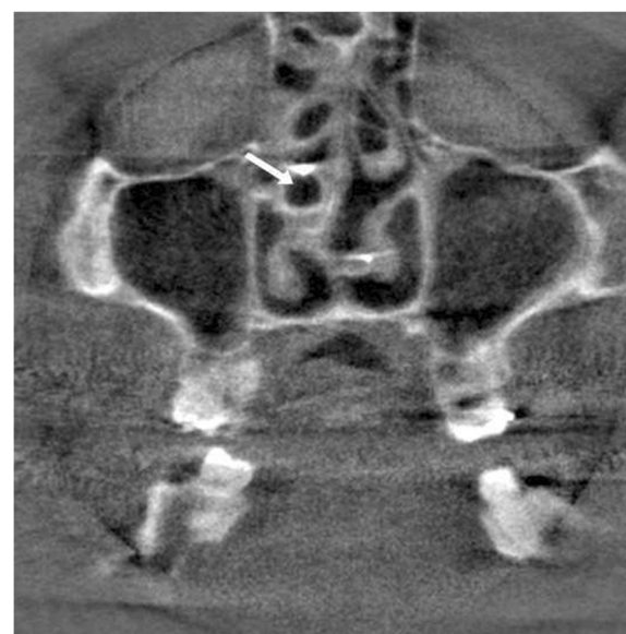
Figure 1 Intraoperative multi-plane reconstruction showing the position of the tube in middle nasal meatus (arrow).

The RAE tube (Mallinckrodt, Glens Falls, NY, USA) was used in 83.3% of cases (n =35), the spiral (xf) in