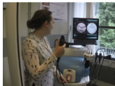
Figure 1. Participant training on the VR simulator.

An assessment tool with established evidence of validity was used to assess the clinical cystoscopy procedures [7]. The tool is based on a global rating scale (GRS) with five different parameters: respect for