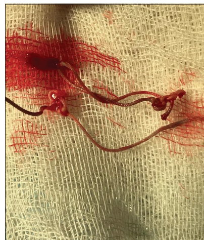
Figure 3: Retained intrauterine suture after hysteroscopic removal

yarns and characterized by high strength and elasticity, good manipulation properties, and reliable surgeon's knot. [5]