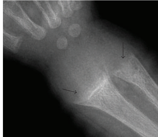
FIGURE 2: Wrist radiograph of the same patient as Figure 1. The distal metaphysis of the radius and ulna is widened and frayed with a mild cupped configuration (arrows).

The patient underwent plain film examination of the chest (Figure 3). Evaluation revealed abnormal proximal humeral metaphyses bilaterally. A subtle lucency was questioned in the right clavicle prompting plain film evaluation of the clavicles and upper extremity. These films revealed