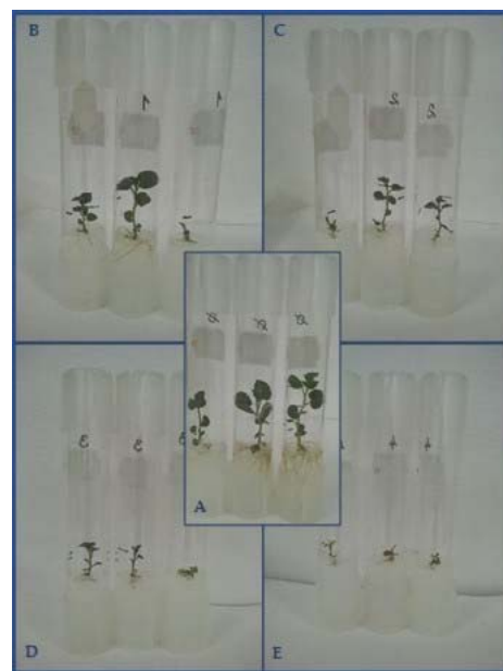
Figure 2. Effect of combined application of RBV and ZDV on V4 potato ( S. tuberosum L.) in vitro shoot culture. Control plantlets on medium without antiviral drug (A); plantlets grown on medium with 10 mg/L RBV + 40 mg/L ZDV (B); plantlets grown on medium with 20 mg/L RBV + 30 mg/L ZDV (C); plantlets grown on medium with 30 mg/L RBV + 20 mg/L ZDV (D); plantlets grown on medium with 40 mg/L RBV + 10 mg/L ZDV (E).

Ribavirin and Zidovudine were applied in combination on eight potato ( S. tuberosum L.) genotypes (seven breeding line and 'Jazzy' cultivar), which were (co)infected by potato virus(es) in different ways. The dose of antiviral agents was determined so that the two active ingredients together did not exceed 50 mg/L; accordingly, increasing levels of RBV (from 0 to 40 mg/L) were combined with decreasing levels of ZDV (from 40 to 0 mg/L). Nodal segments were cultured on the medium with antiviral chemicals for four weeks. In the average of genotypes, the survival rates were decreased from 80.3% to 57.2%, as RBV content increased from 0 to 40 mg/L. However, the responses of genotypes were various. In V2 clone (co-infected by PVM and PVS), only the combination with highest RBV content (40 mg/L RBV + 10 mg/L ZDV) decreased significantly the rate of survival [217]. The shoots of V3 clone (infected by PVM) survived at a low rate (maximum 68.3%) in all treatments, and only the combination 20 mg/L RBV with 30 mg/L ZDV reduced significantly the survival rate. The lowest rates were detected in 1469/83 clone (co-infected by PVM, PVS, and PLRV), and no significantly different results were found in treatments. Survival rates of other breeding lines decreased as RBV level increased, although in general, only the treatments including combination 30 mg/L RBV + 20 mg/L ZDV or 40 mg/L RBV + 10 mg/L ZDV resulted in significant decrease [217] (Figure 2).