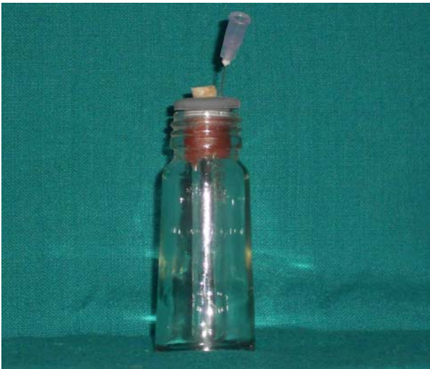
Figure 1. Test apparatus for debris collection.

the upper rim of the collection vial. A 25-gauge needle was placed alongside the stopper during insertion to equalize the air pressure inside and outside the flask. The tubes were numbered. A rubber dam was placed to prevent any bias by the practitioner. This simulated the clinical working environment where the operator is dependent on working length determined by radiographs or electronic apex locators without visualizing the root apex.