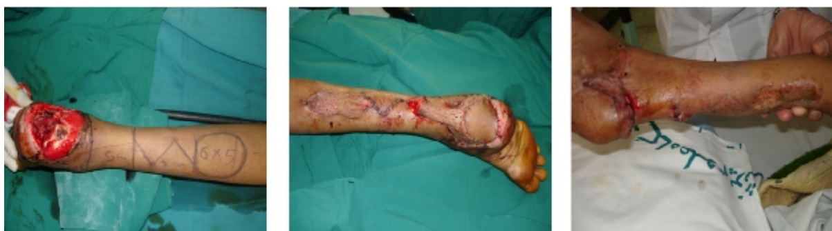
Fig. 3: A: Large heel area soft tissue defect and RISF design (Flap size is 6x5 cm). Middle: Flap inset and donor site reduction with substratum horizontal matters suture. Right: Scar size at the time of pedicle division (After 3 months).