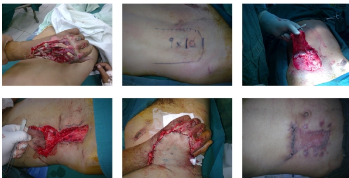
Fig. 1: Above, left: Large hand soft tissue defect. Above, middle: Abdominal flap (10x9 cm). Above, right: Donor site after flap elevation (15.7x10 cm). Below, left: Donor site reduction with three 0 nylon sutures. Below, middle: Complete coverage of defect. Below, right: Donor scar after three months (6.3x9.8 cm).