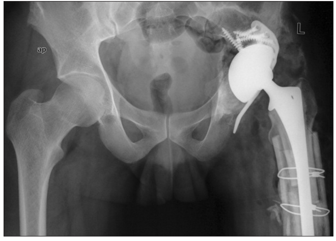
Figure 3: Immediate postoperative radiograph of pelvis with bilateral hips anteroposterior view following the second stage reconstruction illustrating a well-constructed acetabular and femoral defect with cupcage construct and allograft prosthesis composite, anatomic restoration of the hip center, and equalization of limb length. The inferior flange of the cage had cut through the ischium

the allograft with the native bone on the femoral side and good consolidation on the acetabular aspect with no zones of radiolucency [Figure 4a and b]. The patient is walking unaided and has a Harris hip score of 90.