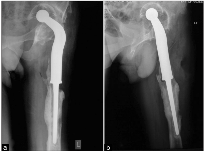
Figure 1: Preoperative radiographs of left hip and thigh anteroposterior (a) and lateral views (b), showing a Paprosky type 3b acetabular defect along with intrapelvic migration of acetabular and femoral component and areas of loosening

grow any organism. He was put on intravenous Amikacin (750 mg once a day for first 5 days) and Magnamycin (2 g twice a day) for 6 weeks and then switched over to oral cefuroxime (500 mg twice a day) for another 6 weeks. The followup ESR and CRP showed a downward trend at 6 weeks and returned to normal by 3 months. Then, the patient was planned for final reconstruction with proximal femoral allograft prosthesis composite for the femoral defect and trabecular metal shell (TM, Zimmer, Warsaw, IN, USA) with cage for the acetabulum. Cup-cage construct was chosen to address the pelvic discontinuity.