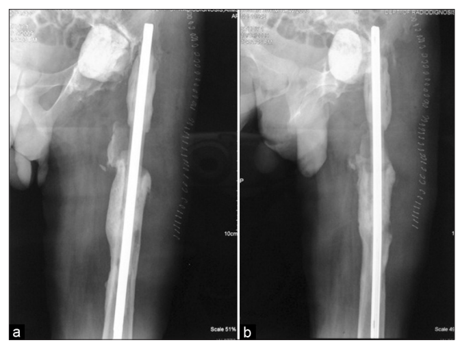
Figure 2: Postoperative radiographs anteroposterior (a) and lateral views (b) following the initial debridement depicting the cement spacer in acetabulum and antibiotic cement coated K nail in the femoral canal

The hip joint was exposed by a standard posterior approach. The cement spacer in the acetabulum was removed, thoroughly debrided, and acetabulum was assessed for size and type of defect. The native bone was present only in posterosuperior and inferomedial portions, constituting around 30% of the true acetabulum with conspicuous pelvic discontinuity. A Homan retractor was placed in the obturator foramen which represents the level of inferior extent of the true acetabulum. The future hip center was identified by horizontal and vertical distances from this point as determined preoperatively from radiographs by comparison with the normal side. The acetabulum was prepared by graduated reaming until the appearance of bleeding bone and sized for the TM shell. The acetabular floor was filled with morselized allograft and prepared by reverse reaming. The TM shell of the size of last reamer was impacted into the prepared acetabulum and then held in place by screws drilled into the posterosuperior portion of the cup. The cup was then assessed for stability with a Kocher's clamp and it was not found to be satisfactory. Thus, the need of a cup-cage