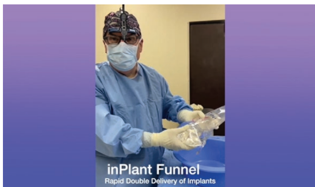
Video 2. Watch now at http://academic.oup.com/asjopenforum/article-lookup/doi/10.1093/asjof/ojab012

of the implant into the funnel such that the seal patch is visible in the proper position, especially for smaller-sized implants.