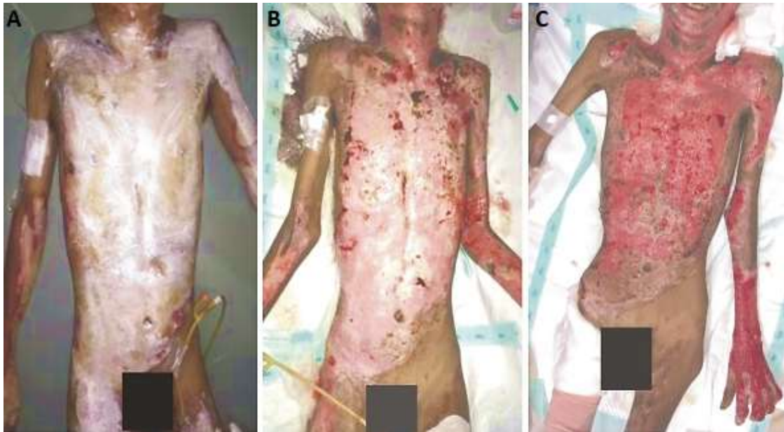
Figure 1: evaluation of clinical status and BMI: A) day 1, BMI 17.57 kg/m 2 ; B) day 28, BMI 12.94 kg/m 2 ; C) day 66, BMI 11.96 kg/m 2