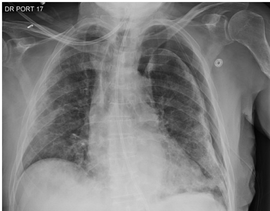
FIGURE 2: Left lung collapse with slight tracheal deviation to the right consistent with a secondary spontaneous pneumothorax