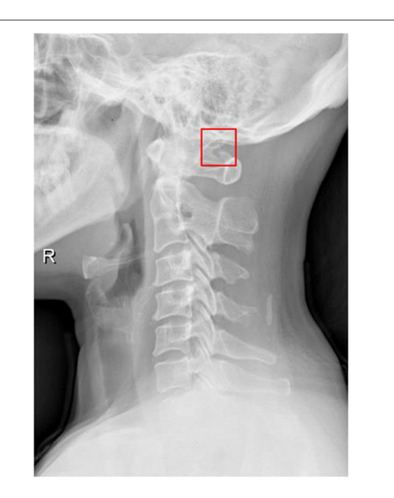
FIGURE 2 | A 44-year-old female with migraine and normal neurologic examination. Lateral radiograph showed the right-sided partial ponticulus posticus, an anomalous bony bridge formed from the superior articulating surface of the atlas but not fused to the posterior arch of the atlas.

We noticed that there were several methodologies to identify the PP in previous studies including cadaveric studies, lateral radiographs, and computed tomography (CT) scans. In our study, we found that the prevalence of PP in different studies was different, which may be contributed to the methodologies. In the radiographic examination, lateral radiographs could not identify the laterality, completeness, and sometimes even the presence of PP. In the study by Kim et al., the prevalence of PP was 26% based on the CT scans, which was only 14% in lateral radiographs (36). The difference was significant and meant that a