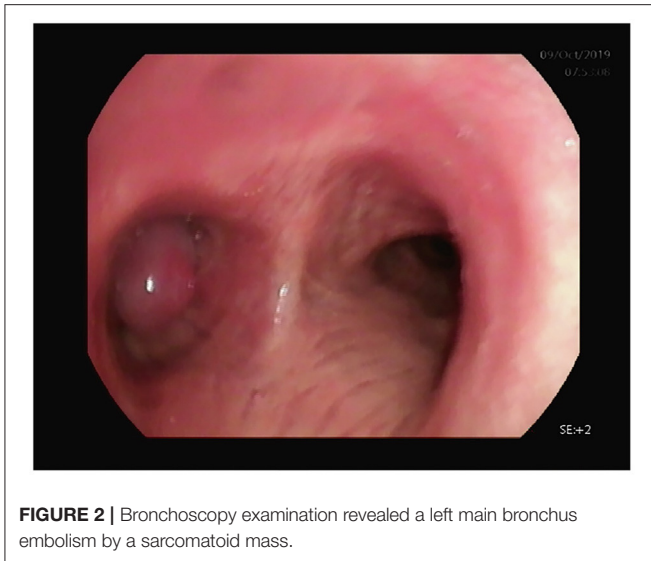
FIGURE 2 | Bronchoscopy examination revealed a left main bronchus embolism by a sarcomatoid mass.

dangerous complication of EBM, is also its least common. The patient underwent a radical left pneumonectomy to resection the lesion and distal lung tissue. No metastasis was found on PET-CT after the left pneumonectomy. The patient's 6-min walk distance was 350 meters.