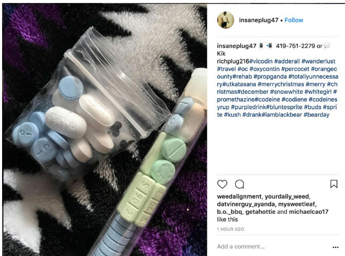
Figure 2. Screenshot from Instagram of Digital Drug Dealer Detected Using Machine Learning.

example, machine learning algorithms (both supervised and unsupervised) can accurately identify and classify illegal sales of opioids, registration of suspicious online seller accounts can be blocked, and Internet service providers can be forced to suspend or takedown illegally operating online pharmacy Web sites. 4,15