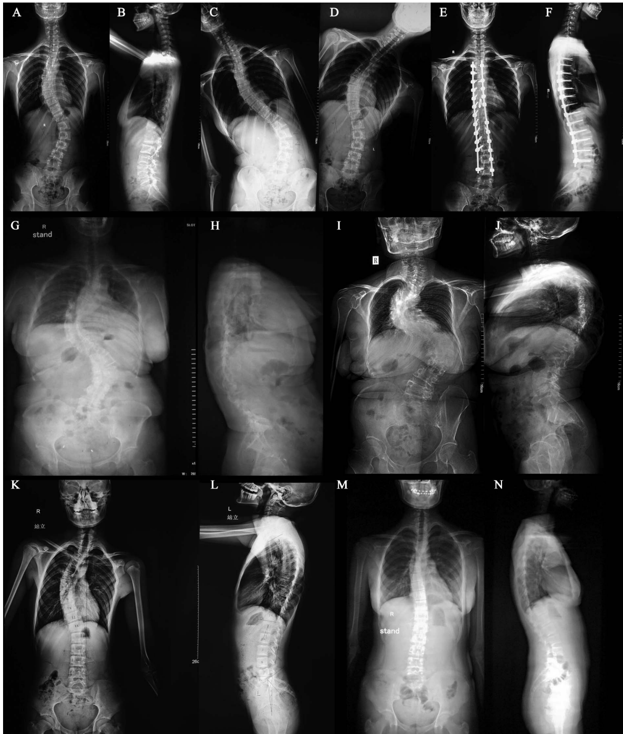
Figure 2 (A–F) The proband (IV9), a 17-year-old girl who had adolescent idiopathic scoliosis for 4 years, and the aggravated deformity. (A and B) Preoperative anteroposterior and lateral views show a thoracic main curve of 62^\circ , lumbar curve of 42^\circ and thoracic kyphosis of 10^\circ . (C and D) Preoperative anteroposterior bending views show the flexibility of the scoliosis. (E and F) Postoperative anteroposterior and lateral views show an excellent correction of the patient, where the main thoracic curve was reduced to 3^\circ , the lumbar curve was 0^\circ and the thoracic kyphosis was increased to 25^\circ . (G and H) III7, a 44-year-old female who had a more than 30-year history of spinal deformity. Anteroposterior and lateral views show a thoracic main curve of 92^\circ , kyphosis of 5^\circ and a lumbar curve of 85^\circ . (I and J) II 5, a 65-year-old female who had spinal deformity for over 50 years. Anteroposterior and lateral views show a proximal thoracic curve of 35^\circ , a thoracic main curve of 102^\circ , kyphosis of 55^\circ and a lumbar curve of 80^\circ . (K and L) IV10, a 10-year-old boy who was diagnosed with a spinal deformity just 1 year earlier. Anteroposterior and lateral views show a thoracic main curve of 45^\circ and kyphosis of 25^\circ . (M and N) IV11, a 15-year-old girl who was first identified as having scoliosis in this imaging examination. Anteroposterior and lateral views show a thoracic main curve of 22^\circ and kyphosis of 18^\circ .

(figure 2). By taking a careful family history, the pedigree with AIS was determined. Five individuals (II5, III7, IV9, IV10 and IV11) in this pedigree were diagnosed with AIS (figure 2). The