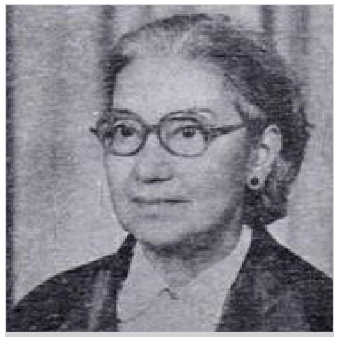
Figure 1. Hatice Bodur. The first female Ear-Nose-Throat (ENT) specialist in Turkey

Dr. Emine Bağdad was the second female otolaryngologist in the young Republic of Turkey, although it was unknown