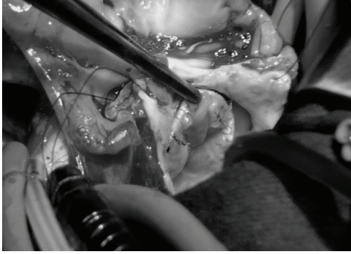
FIGURE 1: Intraoperative view showing the perfect continence of the autograft.

muscular rim; the pulmonary trunk was sectioned just above the commissures. The pulmonary valve sized 10 mm and was mounted inside a 10 mm long woven Dacron tube graft of 12 mm of diameter (Vascutek, Renfrewshire, Scotland). The proximal and distal ends of the pulmonary autograft were then secured to the Dacron graft with three Prolene 7/0 running sutures respectively (Ethicon, Somerville, NJ, USA). The prosthesis was therefore doubly longitudinally incised to allow autograft grow and then implanted in the mitral annulus with 5/0 Prolene (Ethicon, Somerville, NJ, USA) interrupted stitches secured at the distal edge. A top-hat valve with pericardium, as recommended by Kabbani et al. [2], Ross and Kabbani [3], was not feasible for the small dimension of the left atrium. At the end of the procedure, valvular continence was optimal at saline injection (Figure 1). Right ventricular outflow tract was reconstructed with a 12 mm Contegra conduit (Medtronic Inc, Minneapolis, Minn, USA). At CPB suspension, persistent pulmonary hypertension was evident and inhaled NO therapy was started and switched to oral sildenafil 5 days later. The baby was discharged without complications and after 4 months, the echocardiogram showed trivial autograft gradient with no incompetence (Figure 2). 3D echocardiographic evaluation confirmed the good motion of the pulmonary autograft leaflets.