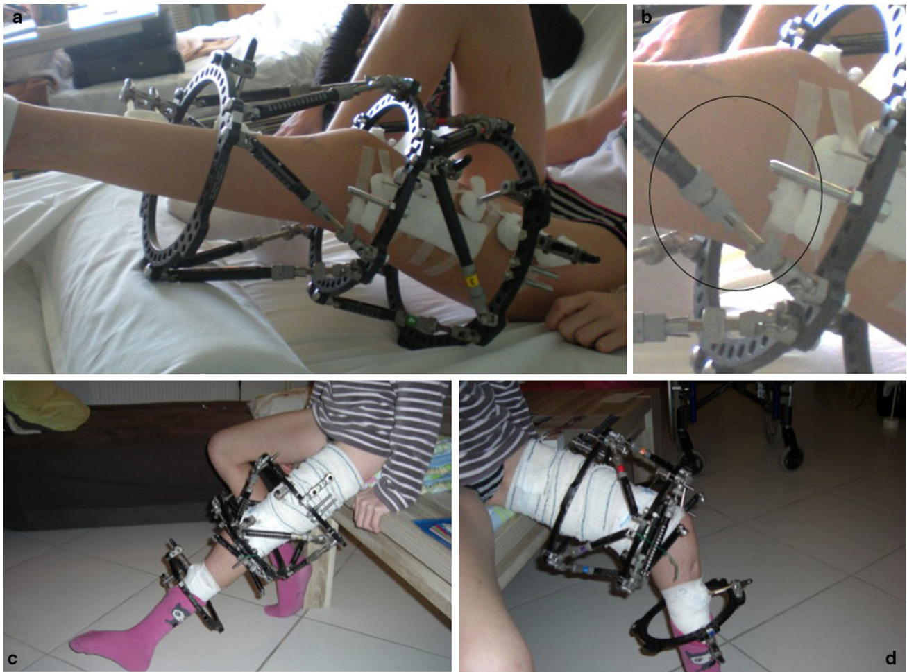
Fig. 2 One can bridge the knee with a hexapod fixator a but with the struts let free b in order to avoid growth modulation. Then, the struts can be removed for physiotherapy allowing knee motion ( c , d )

in term of bone healing. The role of everyone who is involved in the lengthening process is to stimulate daily activities by helping the child and the family to forget the external fixator.