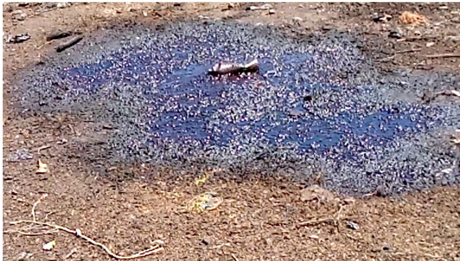
Figure 3. Blood waste in the abattoir site (Kefalew, 2021).