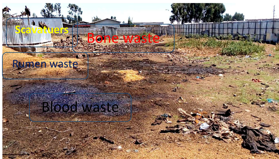
Figure 5. Components of abattoir waste in the abattoir site (Kefalew, 2021).

To know the difference, the emission of GHGs from biogas production will be calculated: