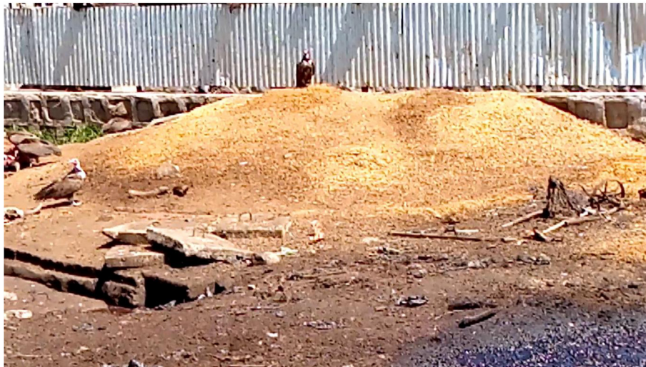
Figure 2. Waste of rumen contents stored in the abattoir site (Kefalew, 2021).