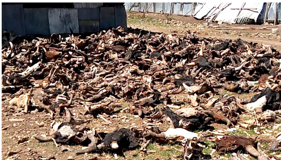
Figure 4. Potential bone waste in the abattoir site (Kefalew, 2021).