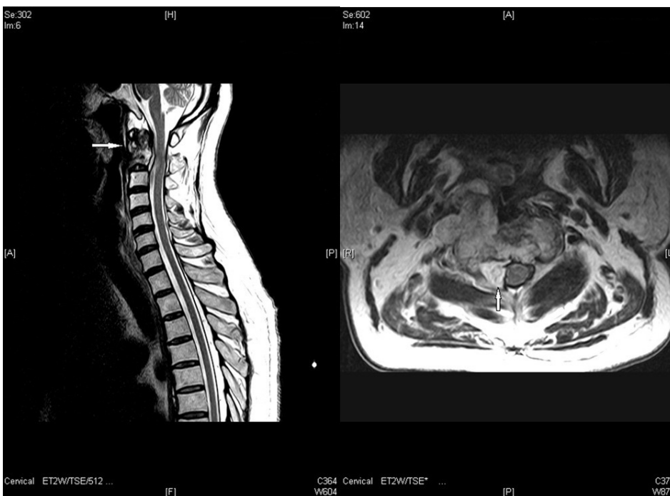
Fig. 1. Sagittal and axial T2-weighted MRI image of atlantoaxial chordoma in case 1. It shows damaged bony structures and soft tissue invasion. Arrow points to the chordoma mass.

A 75-year-old man with the chief complaint of neck pain and tingling in his upper extremities was referred to our institution's pain clinic. On physical examination, his upper extremities had normal motor function but the left thumb and index finger had diminished sensation. There was tenderness on the back of the neck. Bilateral occipital cervicalgia was 7-8 on the VAS score. The patient also complained of a persistent and dull pain in his left shoulder. To control his neck pain, a cervical epidural block was performed at the C6-C7 level using a mixture of mepivacaine 0.5% 5 mL and dexamethasone 2 mg. Despite the block, occipital cervicalgia persisted, and an MRI was performed. In cervical spine MRI images, atlantoaxial bony fragmentation