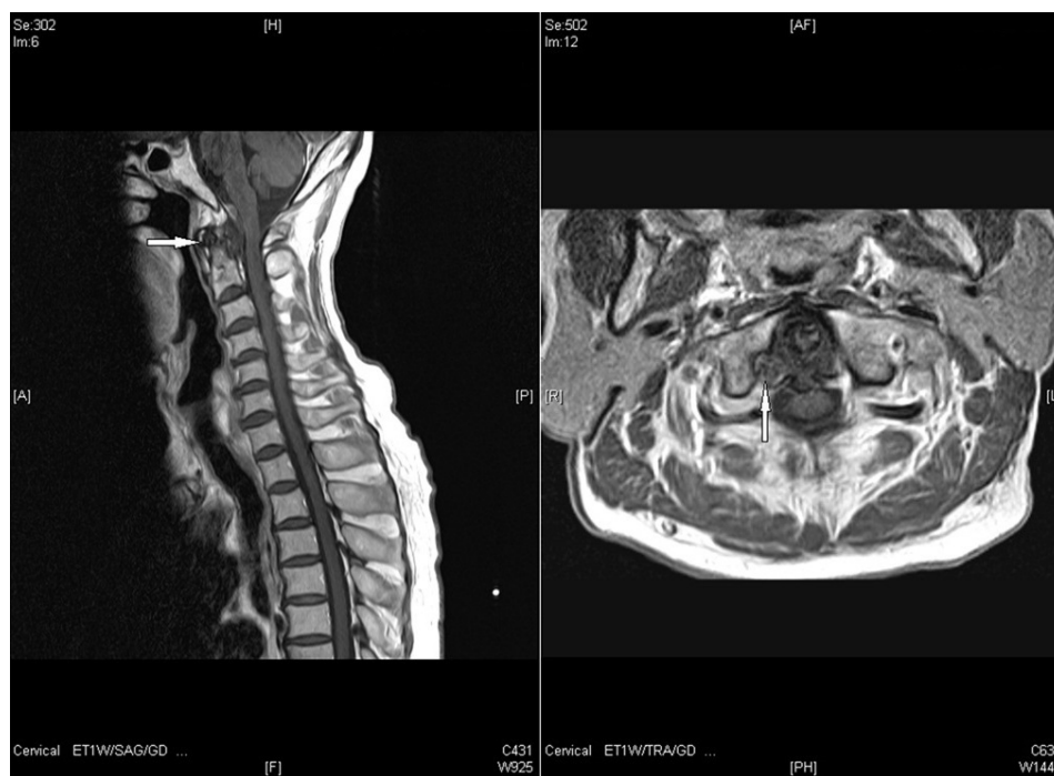
Fig. 2. Sagittal and axial T1-weighted MRI image of atlantoaxial chordoma in case 2. It shows atlantoaxial bony fragmentation and a soft tissue mass in the epidural and prevertebral spaces. Arrow points to the chordoma mass.

The prognosis of chordoma is significantly affected by the first operation; the chance of clinical resolution diminishes with recurrence even with additional treatments. In surgery, en-bloc resection with cancer-free margins ensures long-term survival [10]. If en-bloc resection is not possible, adjuvant radiotherapy is used to remove remnant parts of the tumor. Palliative care of chordoma includes sympto-