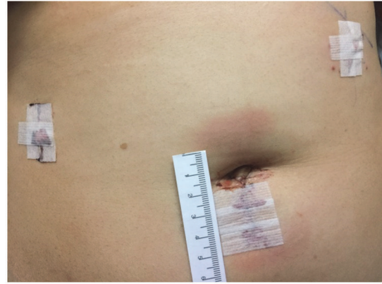
FIGURE 1: One 3 cm mini-laparotomic incision was made to hand-morcellate the large tumor.

An important consideration in the differential diagnosis of this patient should be idiopathic spontaneous intraperitoneal haemorrhage (ISIH), or abdominal apoplexy, which is a rare and often fatal diagnosis. Increasing but still very limited reports mention that ISIH may result from a variety of disease processes affecting the arterial and venous abdominal