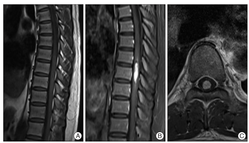
Fig. 1. MRI scan of the thoracic spinal cord : sagittal (A) T1-weighted images, sagittal (B) and axial (C) gadolinium MRI of the thoracic spine showing a solitary mass in the intramedullary spinal cord at T7-8 level. The lesion showed a homogeneous enhancement following intravenous administration of gadolinium contrast.

become the gold standard for diagnosis and evaluation of rare tumors, hence the detection rate of ISCM is expected to increase. Presenting symptoms of ISCM usually consist of weakness, followed in frequency by sensory loss, pain and bowel and bladder disturbance. Weakness and pain present early, as compared to sensory loss, with sphincter disturbance having the latest onset<sup>12)</sup>. Prognosis of ISCM is compounded by treatment modality and tumor type, with lung and breast metastases correlating with the shortest survival. Treatment of ISCM consists of immediate steroid bolus, radiation and chemotherapy with subtotal cytoreductive surgery and the treatment of choice is considered case by case<sup>17)</sup>. High dose dexamethasone may allow for limited and transient neurological improvement, while