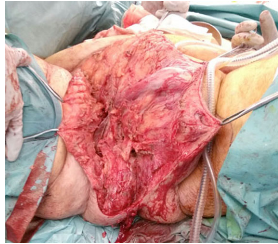
Figure 3: Pelvic and perineal region post-surgical debridement.

The patient was commenced on empiric intravenous antibiotic therapy (vancomycin, lincomycin and meropenem) and was expeditiously taken to theatre by the Urology team for radical debridement of his perineum and right hemiscrotum. Intraoperatively, necrosis of the scrotum and perineum extended over the inguinal ligament towards the right ASIS and the pathognomonic 'dishwater fluid' of liquefied necrotic tissue was seen. The right hemiscrotum required complete dissection and sparing of the penis, testicles, and rectum was achieved (Fig. 3).