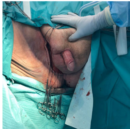
Figure 4: Post application of Artiss with pre-prepared hand ties.

Over the following two weeks the patient returned to theatre for four further washouts (Day 2, Day 5, Day 9 and Day 12).