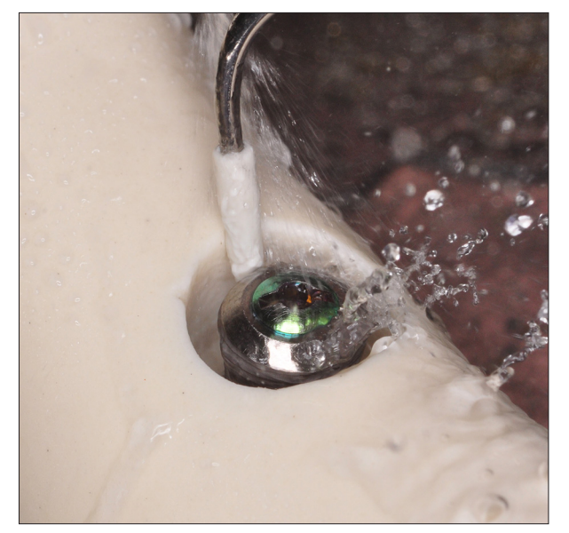
Figure 1. Solely mechanical biofilm removal using a Woodpecker PT5 sonic scaler (Woodpecker, China), working continuously for 2 min with parameters of water pressure 0.5 MPa, tip vibration frequency 28 kHz, and output power 20 W.