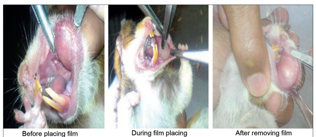
Figure 3a: Placebo film safety study on hamsters