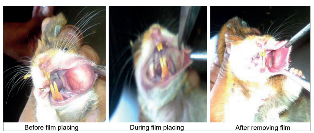
Figure 3b: PBT F3 optimized film safety study on hamsters

compliance, with all class of patients. From the in vivo animal safety studies, it was concluded that the optimized formulation had no irritation or redness on cheek pouch area of hamster and had good acceptability for oral use in treatment of epileptic attack or seizures.