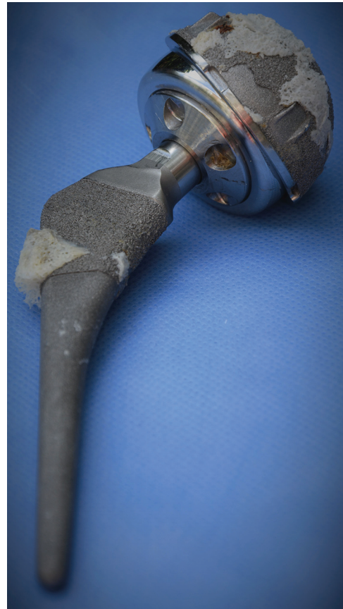
Fig. 2 Retrieval of total hip resurfacing, Bi-Metric TM stem with the M2a Magnum TM components (Biomet; Warsaw, Indiana).

Registry data suggest that MoM total hip arthroplasties fail at a higher rate than conventional THA using other bearing materials. 22 Limitations in the interpretation of registry data are indication bias and the clustering of different MoM devices. Design differences are often ignored in registries and data regarding component positioning are typically unavailable. 21 Table 1 lists survival percentages for the different hip arthroplasties as reported by the four largest implant registries. 23-26