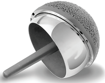
Fig. 1 Hip resurfacing: Birmingham hip resurfacing system (Smith & Nephew; Andover, Massachusetts).

of some types of MoM HR arthroplasties are sufficient, according to the guidelines of the National Institute for Health and Clinical Excellence. 12