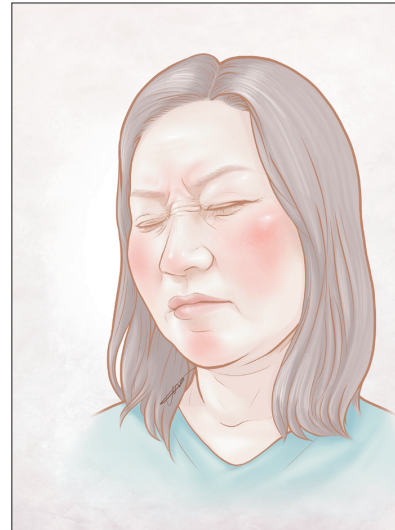
Fig. 1. Vasomotor symptoms in menopausal women.

Due to the increase in average life expectancy, mainly in developed countries, most women spend more than one-third of their lifetime in a postmenopausal state. The mean life expectancy at birth of Korean women was 85.7 years in 2018, 2.4 years longer than that in Organisation for Economic Co-operation and Development countries [1]. Health management and quality of life during the postmenopausal period have received more attention in recent years. Vasomotor symptoms (VMS) in particular, such as hot flashes and night sweating, are major issues experienced by menopausal women (Fig. 1); in fact, 50% to 75% of perimenopausal and postmenopausal women experience some degree of VMS during their lifetime [2]. Unlike traditionally, where VMS were regarded as transient symptoms of perimenopause, recent studies have suggested that VMS can persist for more than seven years after onset