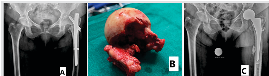
Figure 3: (a) Anteroposterior radiograph taken at 6 weeks showing helical blade cut-out with proximal fragment failing into varus, (b) intraoperative image of the head fragment showing the tract of the helical blade cut-out, and (c) radiograph showing cemented bipolar hemiarthroplasty with calcar reconstruction using mesh.

Cephalomedullary nails have shown less incidence of implant failure and higher union rate as compared to DHS in unstable IT femur fractures and are the ideal implant of