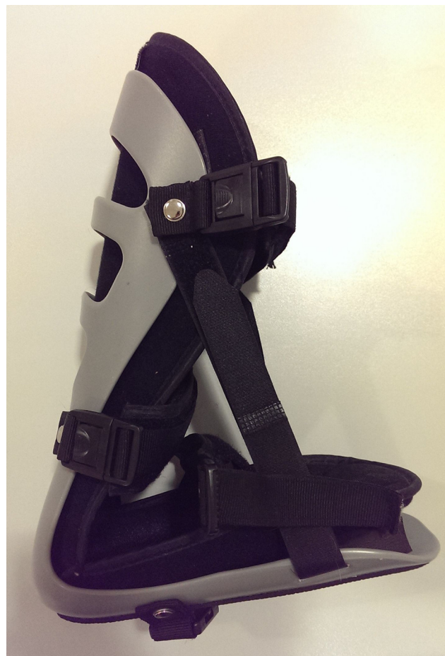
Figure 1 Tension night splint device.

Patients completed a structured questionnaire about their symptoms before treatment commenced and at each the 6 week and 3-month follow-up visits. These outcome measures include questions about pain, as well as a range of validated PROMs which include questionnaires about local function (FFI-r and MOXFQ), in addition to measures of global function (EQ-5D-5L). Questionnaires are also used to examine the impact of symptoms of other areas of functioning including measures of anxiety and depression symptoms (HADS) and sleep quality (PSQI). In addition, questionnaires are used to quantify levels of physical activity. These include the short-form (7-day recall) version of the International