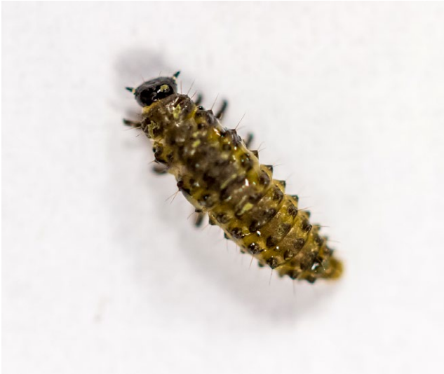
FIGURE 1 Phaedon cochleariae, mustard leaf beetle (Coleoptera: Chrysomelidae), larvae in the third (last) larval stage