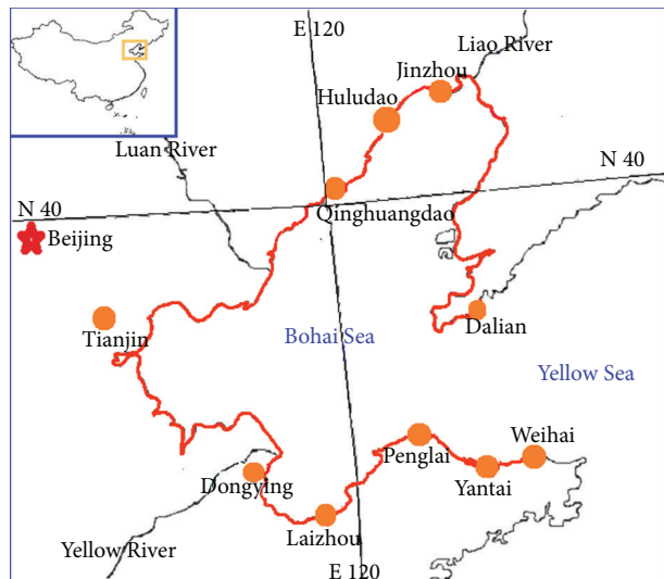
FIGURE 1: Main cities and rivers around Bohai Sea.

China is a big country in producing and using chemicals, and the pollution problem of legacy POPs has continuously attracted public attention. Candidate POPs, also called “emerging POPs,” have become a hotspot in the environmental research and management.