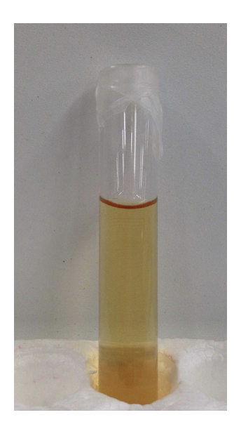
Figure 1. The color of the urine was brown but not dark.

eGFR: estimated glomerular filtration rate