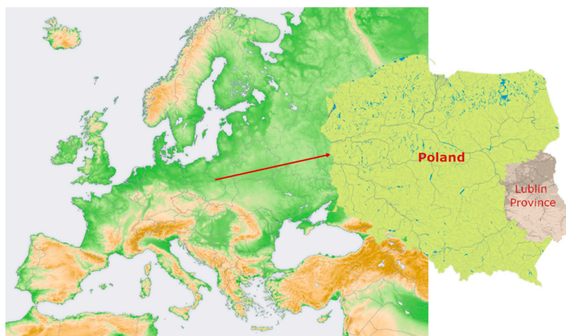
Figure 2. Study area at the national (Poland) and regional (Lublin Province) level, based on Wikimedia with our modifications.