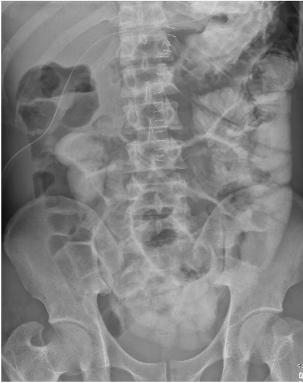
Figure 4: Contrast follow-through study (ileus).

a spontaneous combustion of the gas-filled peritoneum in the setting of proximal small bowel perforation. They concur that electro-surgery devices are the most common energy source for ignition. Importantly, when considering the presence of an oxidizer, the consideration of anaesthetic pre-oxygenation is paramount. The concentration of oxygen in the gastrointestinal lumen decreases distally but is artificially increased in this setting. When reviewing the fire triad, it is pertinent to understand that a proximal enteric perforation will expose the peritoneum, and therefore the ignition source upon entry to this space, to a higher concentration of oxygen. This can be artificially enhanced by anaesthetic techniques [5]. Historically, other sources of an oxidizer included peritoneal insufflation with oxygen or nitrous oxide; however, the newer use of carbon dioxide confers the advantage of higher blood solubility and has an inhibitory effect on flammability [3].