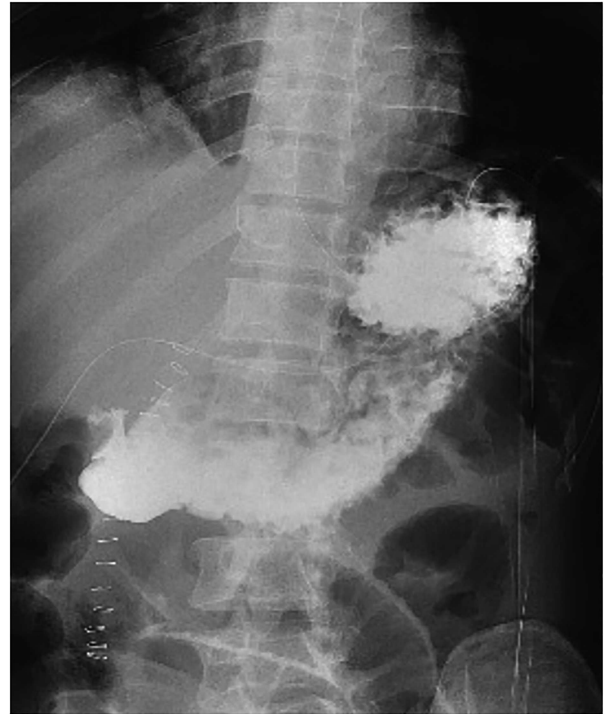
Figure 3: Contrast follow-through study.

abdomen with aqueous Betadine and draping with square surgical drapes. Upper midline laparotomy approach was decided upon, and incision through the skin and subcutaneous tissues was initiated with a size 15 scalpel blade and continued with monopolar diathermy until the peritoneum was encountered. Upon attempting to enter the peritoneum, which was tense and distended, a loud 'pop' was heard, with a sudden rush of air and heat generated at the end of the diathermy. There were no obvious injuries to the patient from this combustion event or to the surgical team and laparotomy proceeded. A localized 1 cm perforation of the antrum of the stomach was found with contamination of enteric contents locally. An omental patch repair