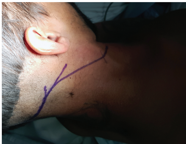
Fig. 2 Intraoperative photograph showing incision lines in combined far-lateral, suboccipital lateral neck dissection.

Though uncommon, MPNST must be considered in the differential diagnosis of tumors involving the cervical nerve