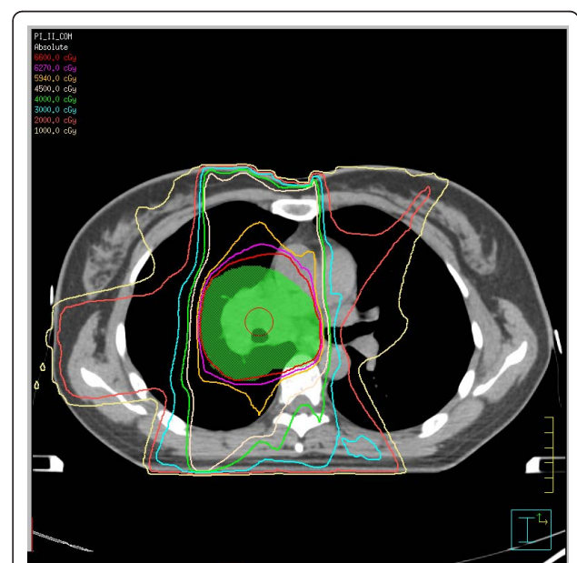
Figure 2 CT based IMRT plan of Patient 10.